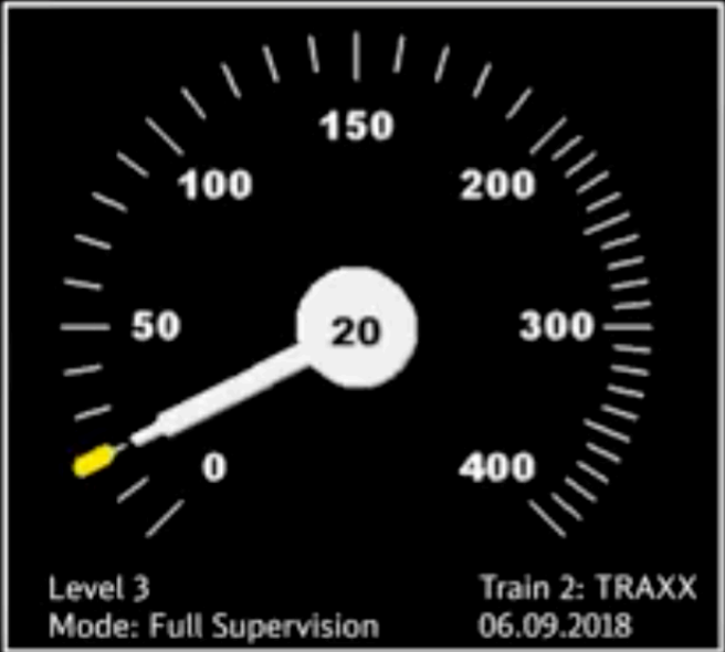
ProB running in real-time animating a formal B model of the Hybrid-Level 3 principles developed by a team from the University of Düsseldorf and Thales with support from ClearSy