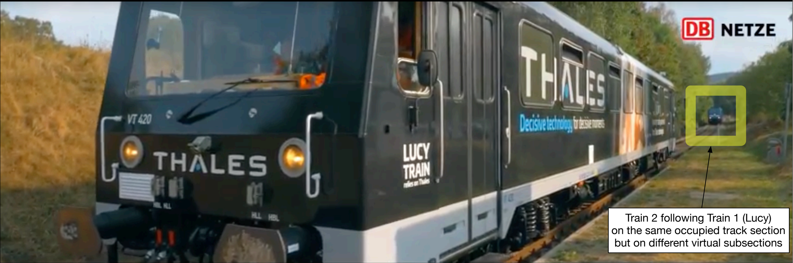
Train 2 following Train 1 (Lucy) on the same occupied track section but on different virtual subsections